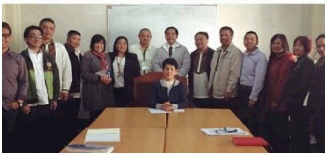
Project Briefing and MoA signing with the local government of La Trinidad