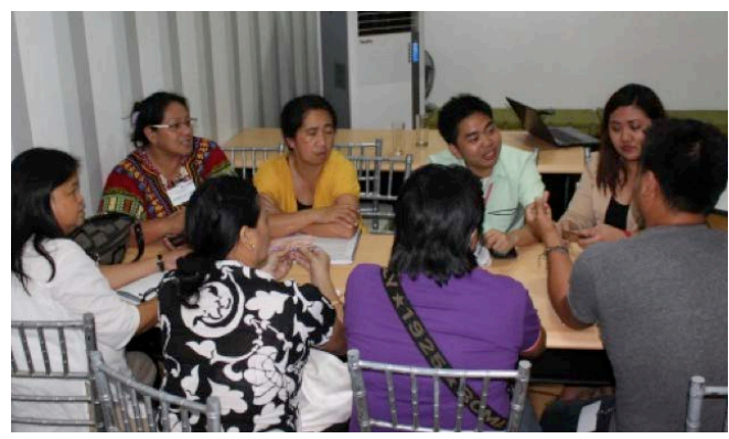
Session 2: CSO discussion, filling-in of the APCPI tool and local action planning