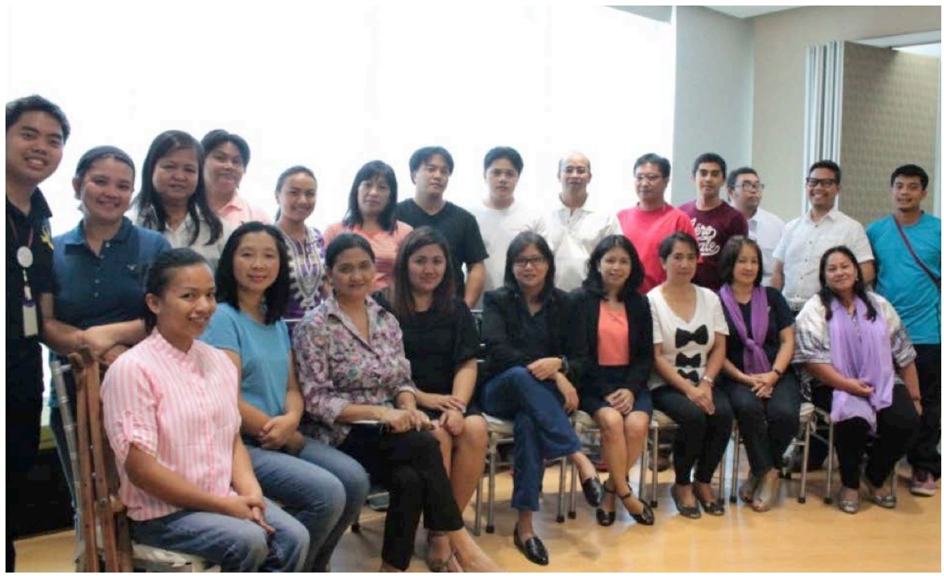
Workshop with the local government of La Trinidad and 6 civil society organizations