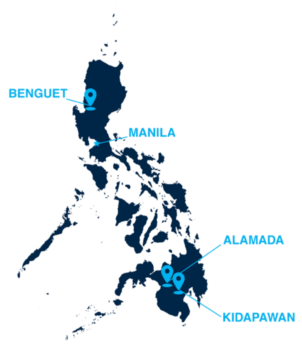
Figure 2. A visual representation of the Philippines<sup>13</sup>, with the OD4Transparency project locations marked.