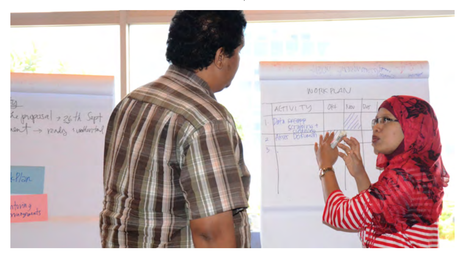
Box 2. OD4Transparency project outcomes.