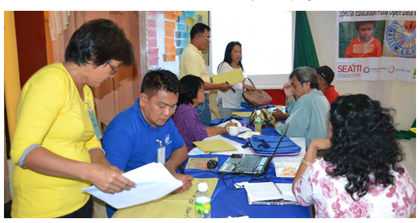
Picture 11. E-Net introducing open data to a wider group of educators through their established network. Through this project, they were able to get more community involvement in pushing for better education.

In the case of E-Net, using open education data and training other CSOs increased the number of organisations advocating for better education spending, widening E-Net's networks and influence. It also led to more community involvement in how resources were allocated.