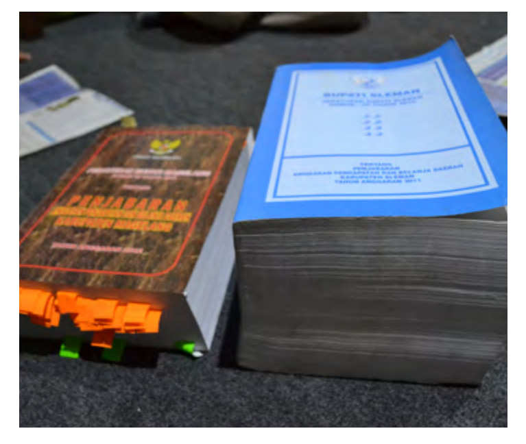
Pictures 5 and 6. The thick books are the published budget and spending data of Yogyakarta city from 2012 to 2014, which was visualised by IDEA into a newspaper format so that citizens could better understand where their taxes went.

IDEA is now in the process of formalising a partnership with the regional tax office and the financial management office of Yogyakarta to ensure proactive publication of the city budget and linking the city government website to IDEA's new Open Data APBD portal. The organisation is also strengthening its efforts to increase the use of budget information by citizens and citizen groups, more particularly in the advocacy for better allocation of budget resources to fulfil socio-economic rights.