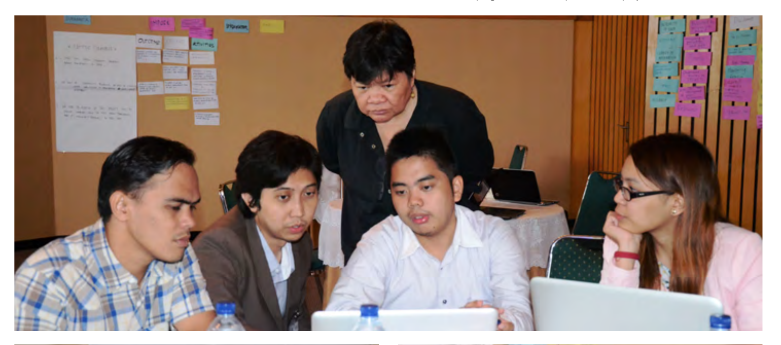
Picture 8 to 10. E-Net and INCITEGov members being trained in data scraping and analysis; Materials developed by E-Net as part of their pilot project and the SEF Open Data Toolkit displayed in the final workshop; INCITEGov developing their initial workplan for their project.

resulting in a long waiting period before a decision was made on the matter. The city planning division, on the other hand, was reluctant to share more datasets than what were already provided. While the project failed to generate commitment from within government, it increased awareness of both civil servants and citizens that open data offers an opportunity for better data sharing and use. Pattiro will continue to advocate on the issue with government leaders in Surakarta.